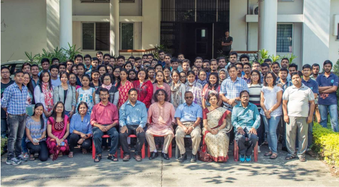
A group photo taken during the lecture workshop