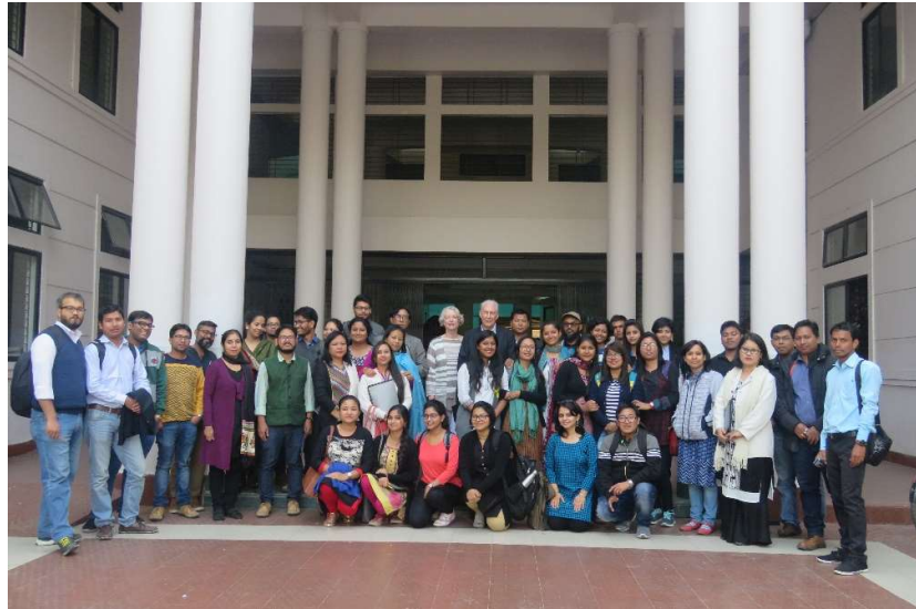
Group photo of Workshop on Cognitive Linguistics Date: 05.02.2017 Time: 04:39 PM