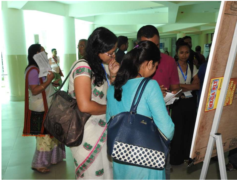
Poster Presentation during the International Conference on 23 rd Himalayan Languages Symposium Date: 06.07.2017 Time: 11:19 AM