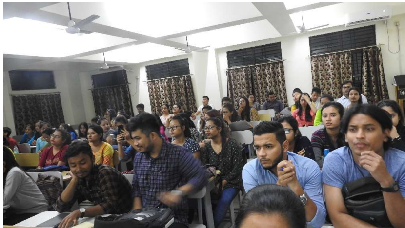
Attendees of the National Conference on the Indigenous and Lesser Studied Languages (ILSL) Date: 29.10.2019 Time: 05:05 PM