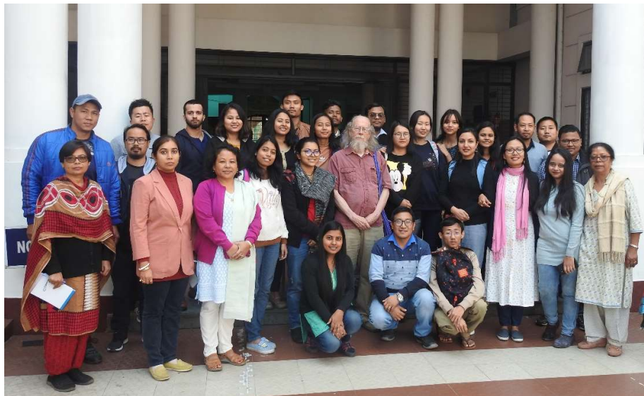
Attendees of the Workshop on Kuki-Chin Languages of North East India Date: 12.02.2020 Time: 12:57 PM