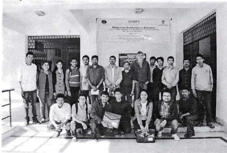
Resource persons and participants in the winter school