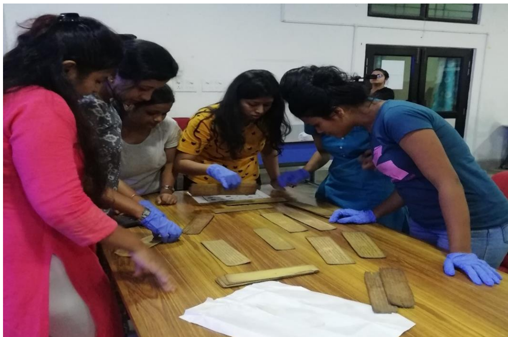
Photo 5: During practical exercise in the workshop (original sanchipat manuscripts were arranged according to page)