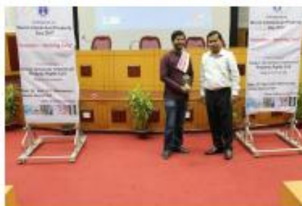
Felicitation of the Quiz Master