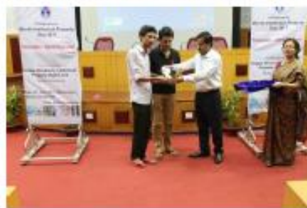
Winners of Quiz