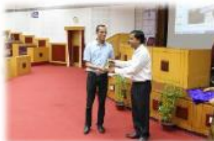
Felicitation of the selection panellist