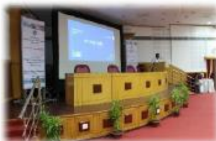
Inauguration of Quiz Competition