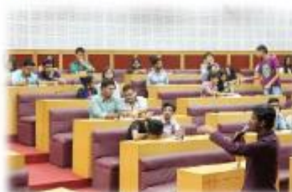
Quiz master anchoring the competition