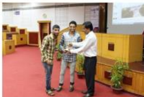
Winner of Best Innovative Idea Competition