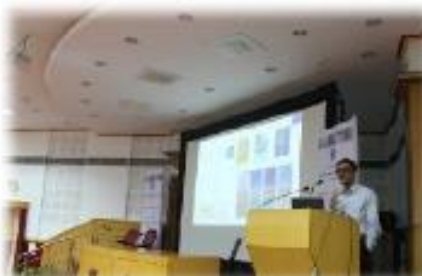
Invited Speaker during his deliberation