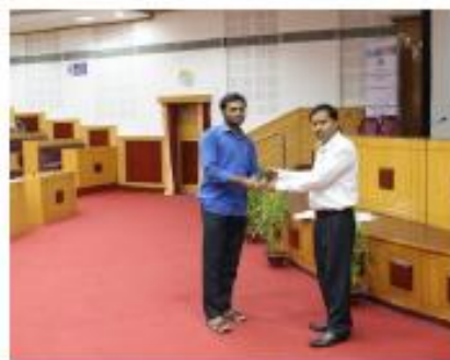
Winner of Best Innovative Idea Competition