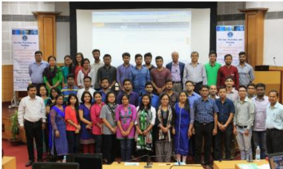
Photo: Participants of the workshop with the organisers and the resource persons

research at all levels and subject areas by providing over 4 million plus eBook and 16 Million Journal articles, Audio Books, Children Books etc. in multidisciplinary subjects, originally scanned from the shelves of the top 50 University Libraries in the world published from the year 1000 till the 21st century that are fully downloadable without restrictions. It is the first and only one to offer Digitally Re-Mastered Editions of the most influential books ever printed from the 10th until the 21st century.