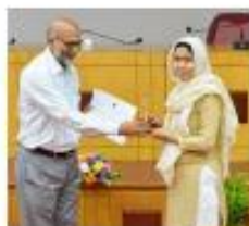
(Left) Winner of the best slogan writing competition receiving prize