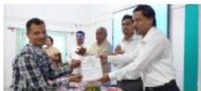
Photo: (Top Right Top Left and Bottom Right) Weavers and Cultivators of Muga silk receiving Authorised User Certificate from the distinguished speakers and the invited Guests of the workshop organised at Harhi College on 24 th of October on "Effective use of geographical indication and trademark in the market for handloom industry".