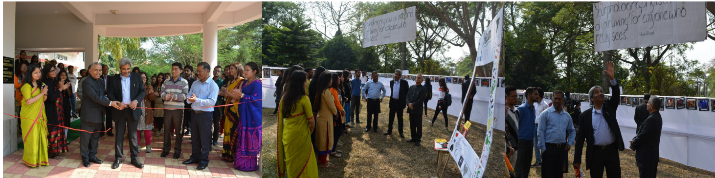
Photo: Inauguration of the event and photo exhibition