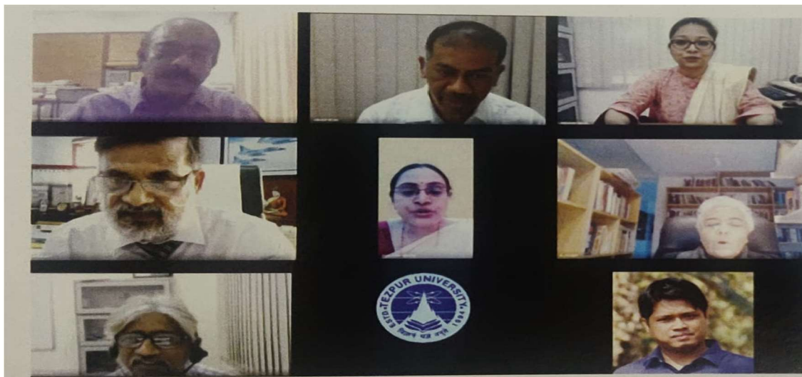
Photo: Celebrating National press day in an online platform