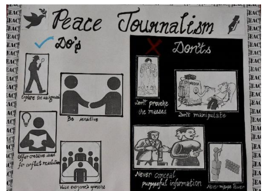
Some Do's and Don'ts of Peace Journalism showcased on a poster

It must be mentioned that the students also presented a "Poster Exhibition" that added vibrant colors to the cause. They created artistic pieces on topics like Gandhian Way of Life, Pulitzer Award Winners, Do's and Don'ts of Peace Journalism, Assassination of Journalists, Conflicts in North east and many more. All the invited guests and dignitaries took out time to walk through the poster exhibition to praise