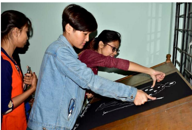
A pledge for peace - Participants putting their thumb impressions

He ended by saying that the seminar was indeed an eye opening experience and gave food for thought in media's role in covering conflict.