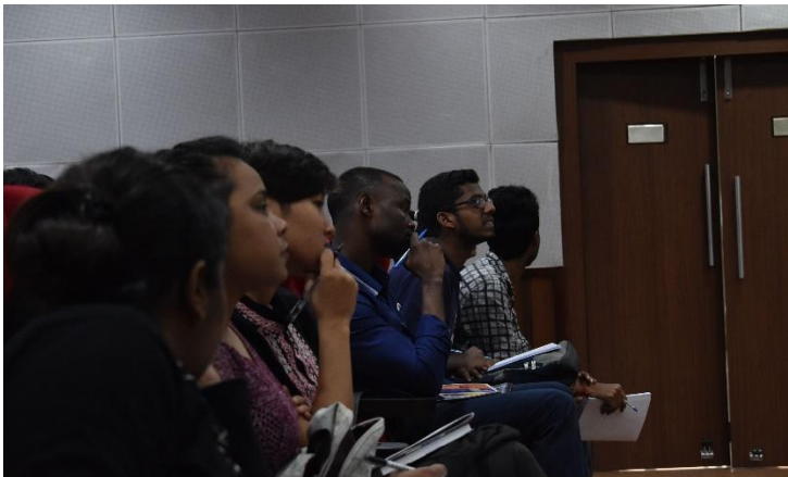
The students brainstorming during the workshop

The Anti-war movement in Vietnam in the 1960s-1970s furnishes a great example of a peace movement given due importance by the mass media. The movement against U.S. involvement in the Vietnam War began small—among peace activists and leftist intellectuals on college campuses—but gained national prominence in 1965, after the United States began bombing North Vietnam in earnest. Anti-war marches and other protests, such as the ones organized by Students for a Democratic Society (SDS), attracted a widening base of support over the next three years, peaking in early 1968 after the successful Tet Offensive by North Vietnamese troops proved that war's end was nowhere in sight.