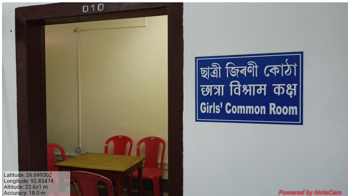
Girls' Common Room, Dept. of Energy