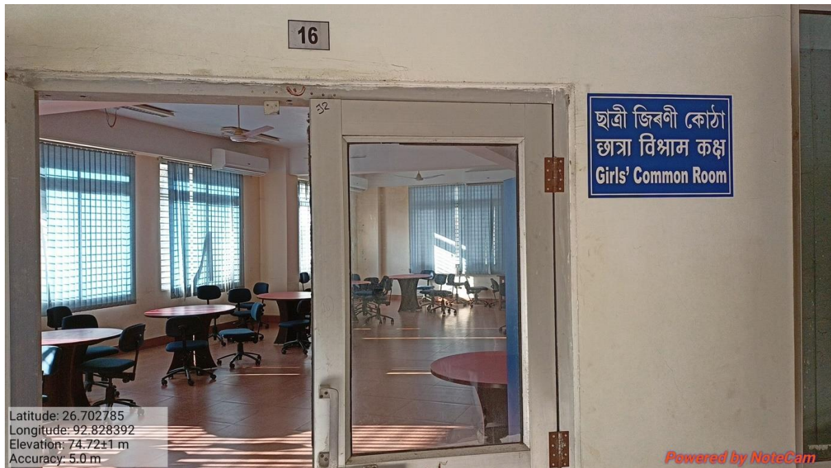
Girls' Common Room, Dept. of Business Administration