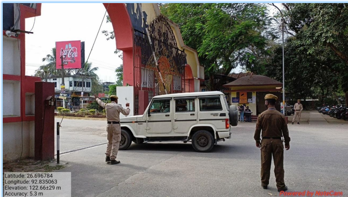
Security personnel at main gate