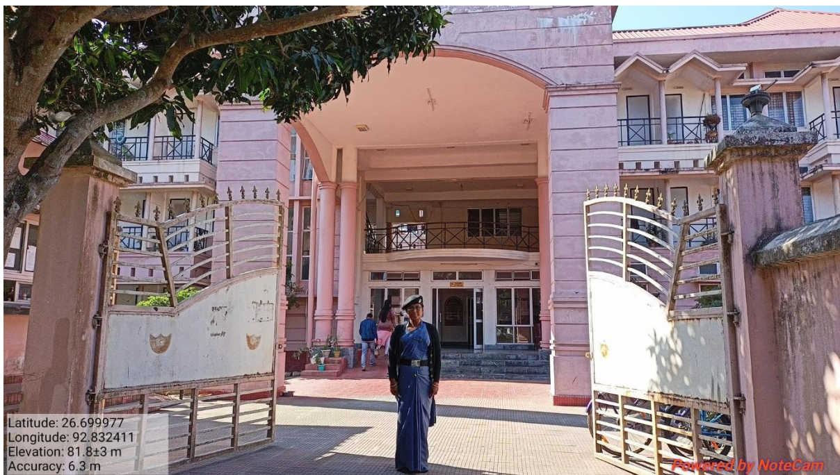
Lady security at Girls' Hostels

Female security personals are engaged in Girls' Hostels.