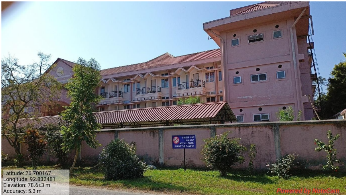
High concrete walls around each girls' hostels

Girls' hostels are secured with high concrete walls with one point entry and exit.