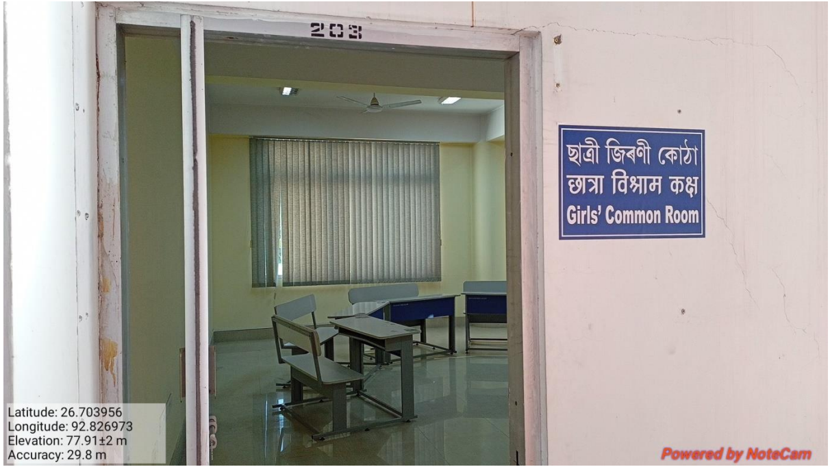
Girls' Common Room, School of Engineering