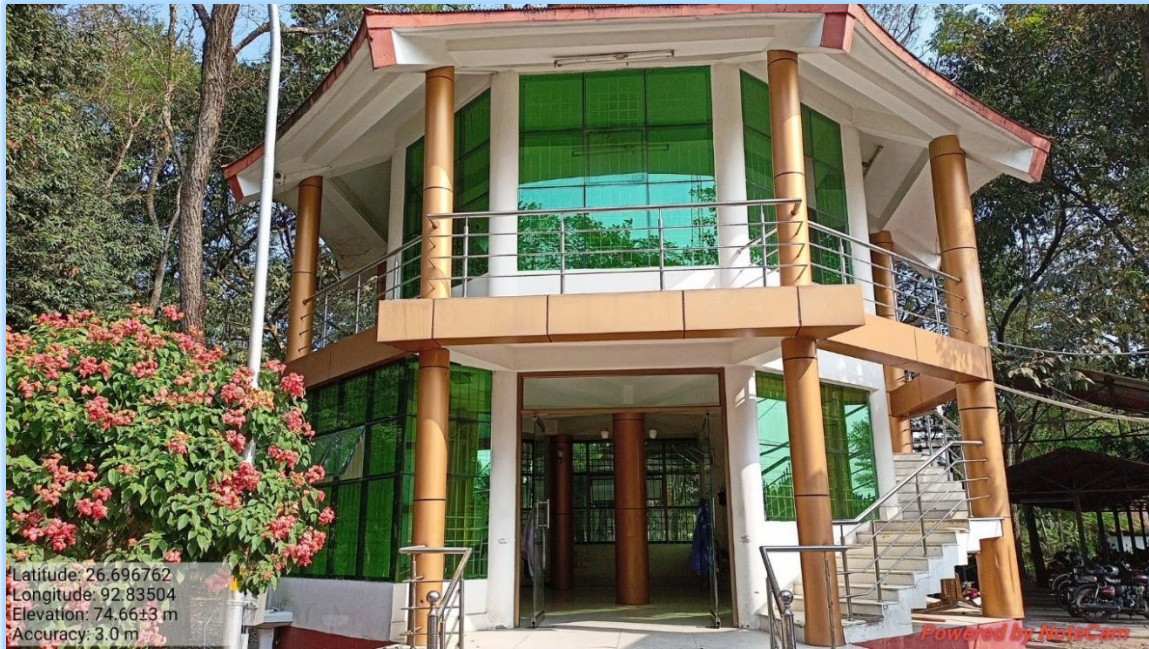
Security point at the main entrance

The 261.47 acre campus of the University is located in a safe & quiet environment and secured by concrete walls. The University maintains a 24x7 security arrangement supervised by a Security Committee consisting of faculty members and officers. There is a single point entry under the round the clock watch of security personnel and there 183 (various types) CCTV cameras are installed at the vital locations of the campus.