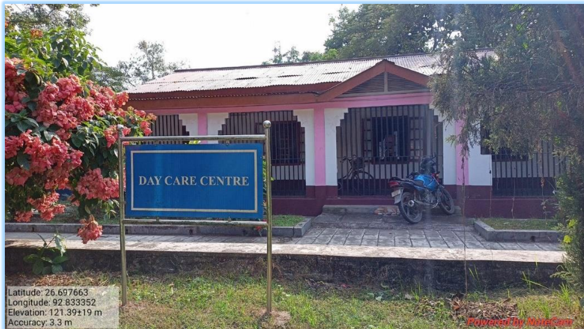
Front view of day care centre

The University has a full-fledged Day Care Centre that facilitates childcare facilities for the employees of the University.