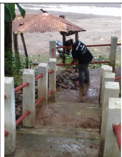
A glimpse of a student at work