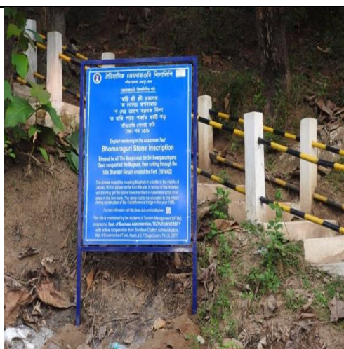
Signboard at the site highlighting the role of students of MTTM (Dept. of Business Administration) Tezpur University