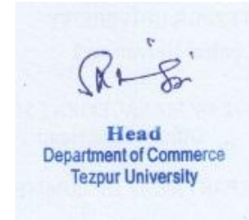
Signature of Departmental Head