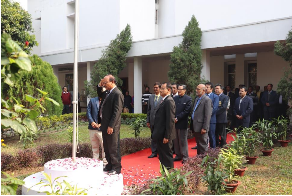
Image: 25 th Foundation Day celebration 2019