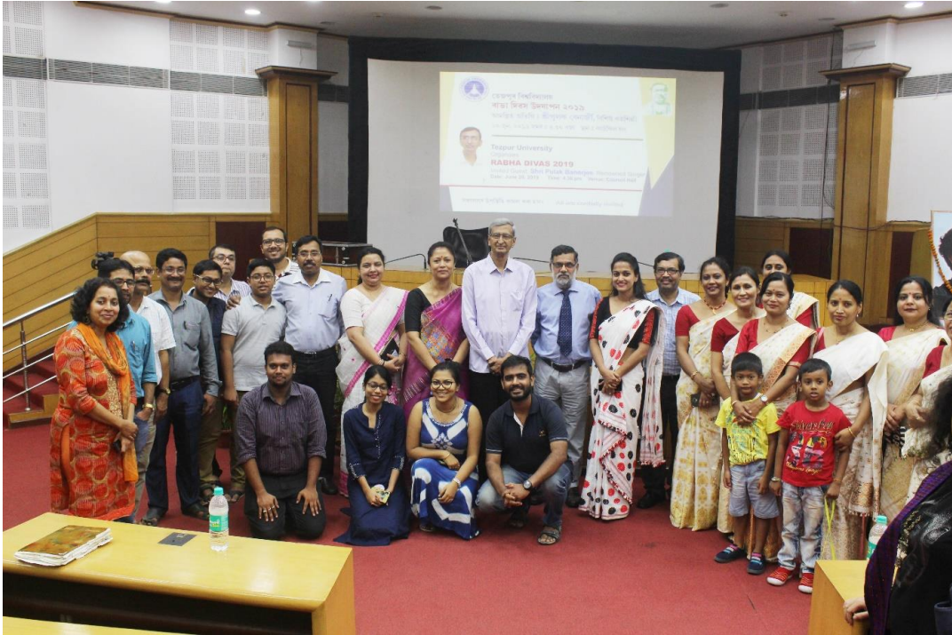
Image: Rabha Divas celebration 2019