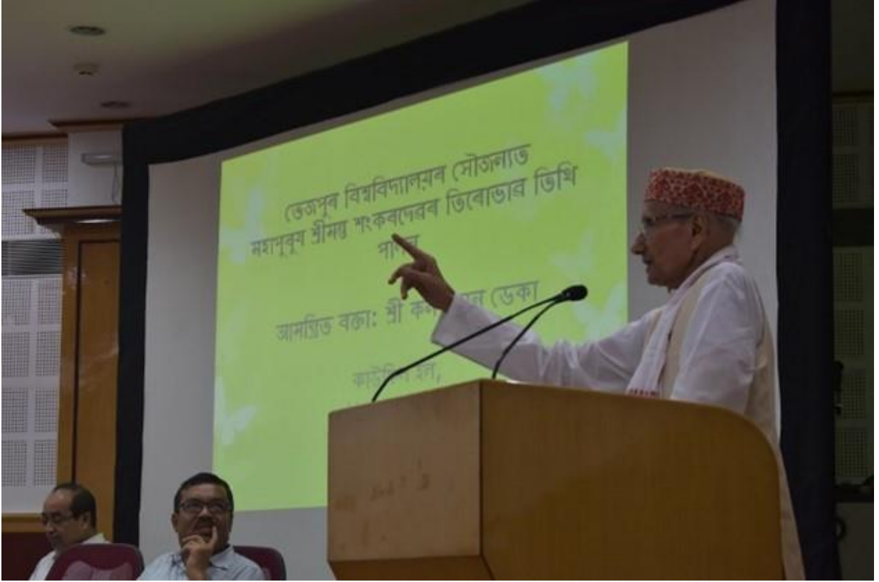
Image: Tithi of Sankardev 2018