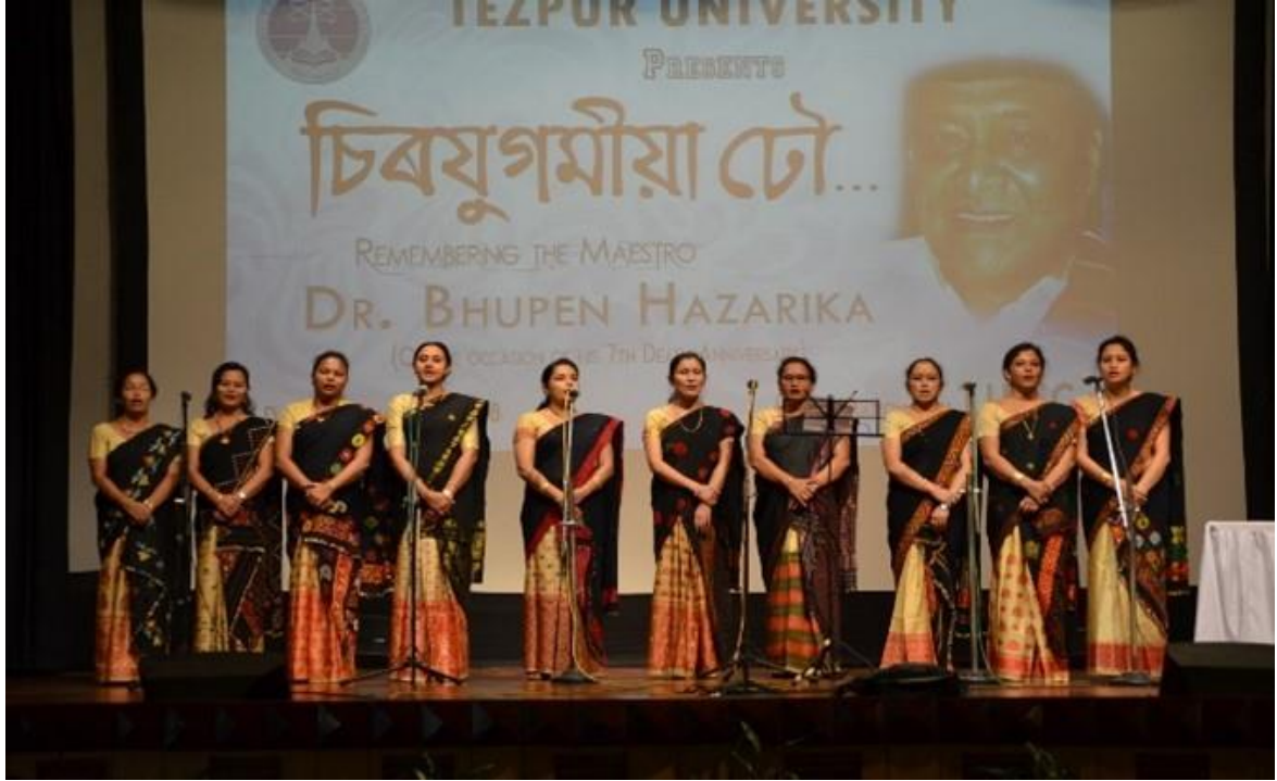
Image: Tribute to Dr. Bhupen Hazarika 2018