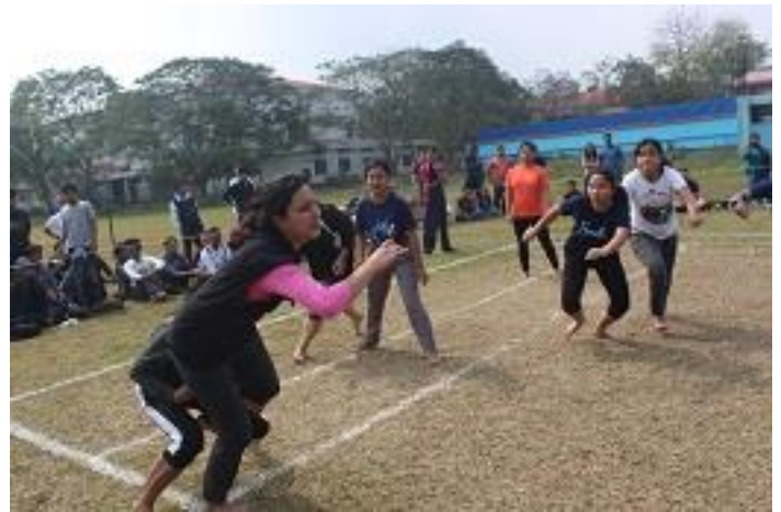
Image 3. Prize distribution and sports events of the 22 nd Annual meet.

The Annual Meet 2018-2019 of Tezpur University is organized by the Students Council during 22 nd February 2019 to 24 th February 2019. There were both group and individual competitions. The group competitions are either Inter-Departmental or Inter-Hostel. Some of the major competition's events are Dances, Drama, Song, Literary, Debate, Photography, Fine Arts, Wall Magazine, Cultural procession etc.