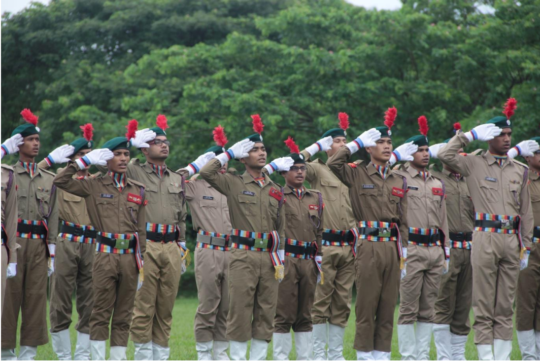
Image: Independence Day Celebration in Tezpur University 2018

The 72 nd Independence Day of the Republic of India was celebrated at Tezpur University along with the rest of the country on Tuesday, 15 th August 2018. The Independence Day celebration started with flag hoisting by the honourable Vice Chancellor followed by the National Anthem. Various patriotic songs, chorus and dance events were performed by the students. The programme ended with light refreshments.