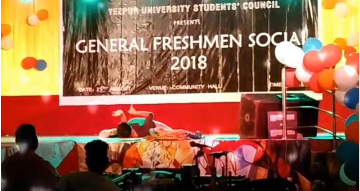
Image: General Freshmen Social celebration 2018

The General Freshers 2018 was organised on Friday, August 17th, 2018, 6.00 pm at Community Hall. Various cultural events were performed by the new students as well as the seniors. The event limelight was the Mr/ Miss freshers' contest. The event concluded with a dinner for all the students and Tezpur University community members.