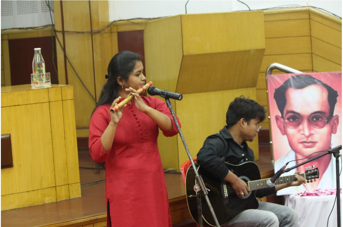
Shilpi Divas celebration 2019