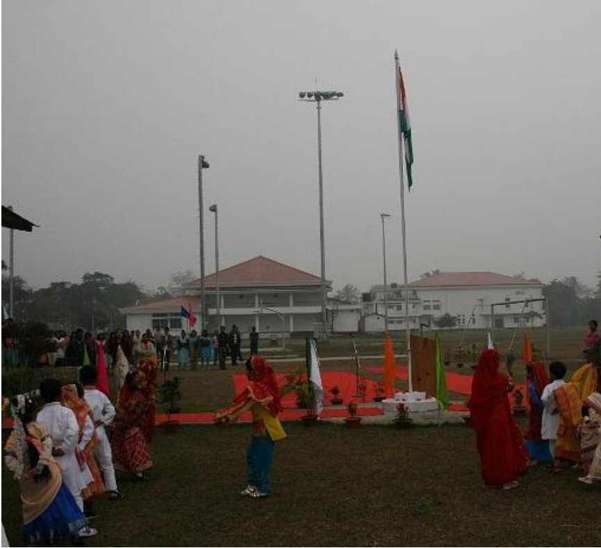
Image: Republic Day cultural programme 2019

The 70 th Republic Day of the Republic of India was celebrated at Tezpur University, along with the rest of the country on 26 th January 2019. The Republic Day celebration started with flag hoisting by the honourable Vice Chancellor followed by the National Anthem. Various patriotic songs, chorus and dance events were performed by the students. The programme ended with light refreshments.