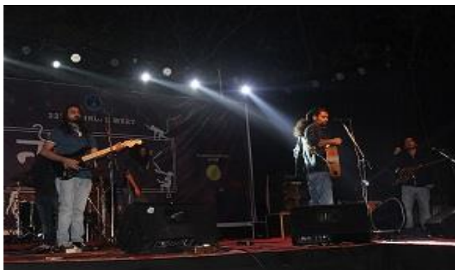
Image 4. Cultural event at the 22 nd Annual meet.