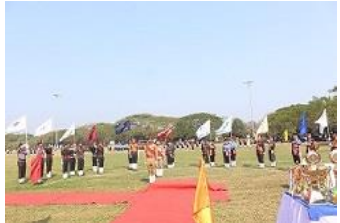
Image 2. The Prize distribution ceremony and the march-past event, 22 nd Annual Meet.