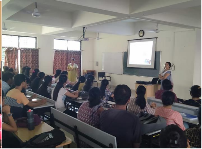
Gender Sensitisation Programme organised for the Students and Staffs of Department of EFL on 22 nd August 2019