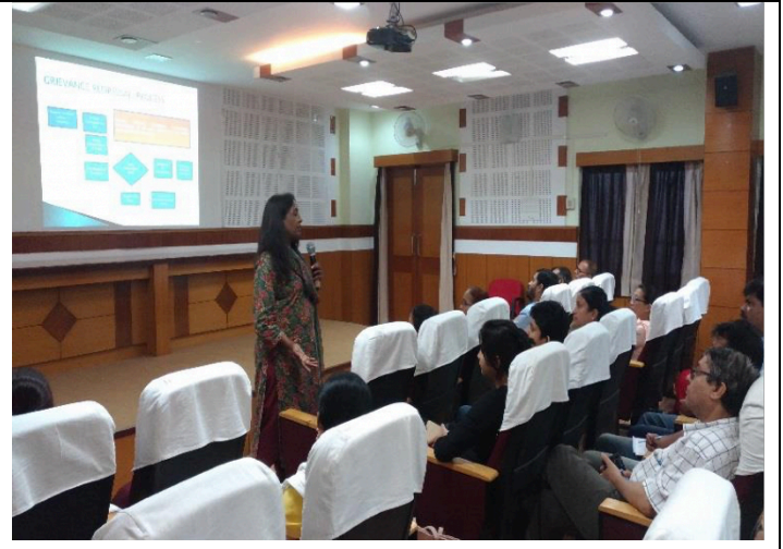
Resource Person and the Presiding Officer in discussion with the faculty members