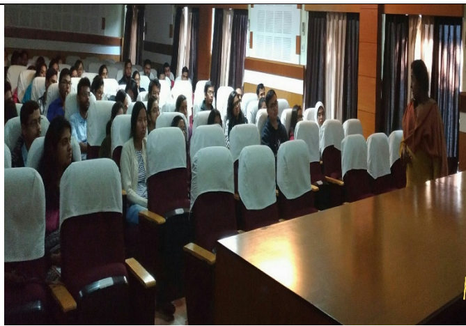
Sensitisation Programme organized for the students of Department of MBBT on 21 st February 2019