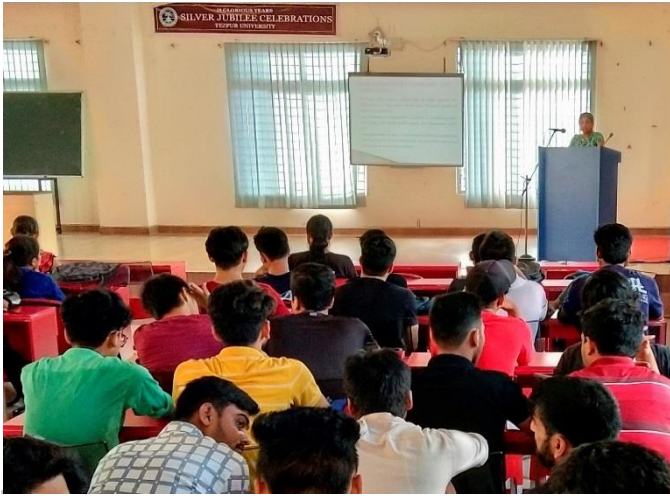
Gender Sensitisation Programme organized for the students & Staff of Department of Civil Engineering on 22 nd August 2019