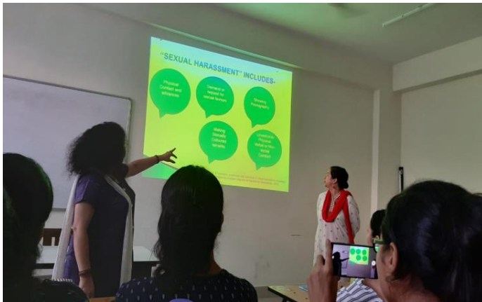
Gender Sensitisation Programme organized for the students & Staff of Department of Cultural Studies