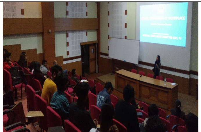
Sensitisation Programme organized for Civil & Food Engineering & Technology Department students on 21 st February 2019