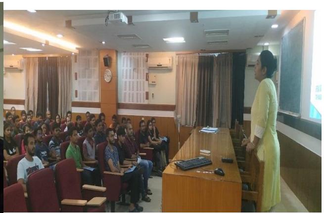
Gender Sensitisation Programme organized for the students & Staff of Department of CSE on 20 th August 2019