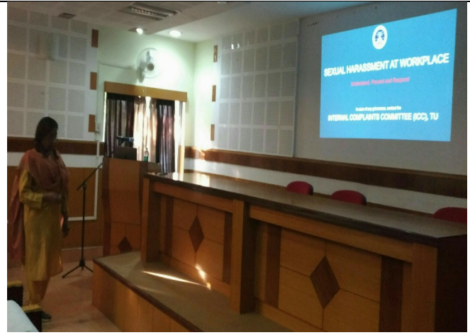
Sensitisation Programme organized for the students of Environment Science Department on 21 st February 2019