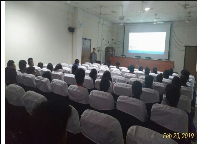
Sensitisation Programme organized for the students of Energy Department on 20 th February 2019